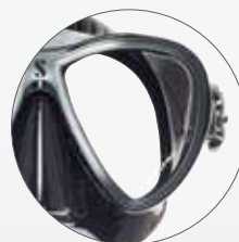
TWIN LENS PRESCRIPTION INSERTION (ask dealer for more information)